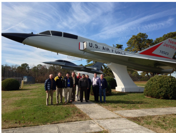
FET Team attending meeting in ACY